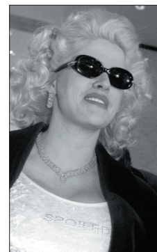
While giving her testimony seeking her deceased husband's estate, Anna Nicole Smith wore a shirt with the word "spoiled" on it.